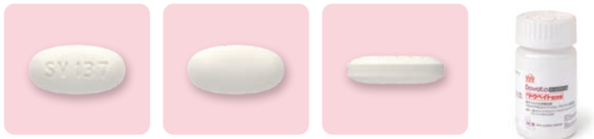
Dovato Combination Tablets (actual size)

Dovato Combination Tablets are white tablets.